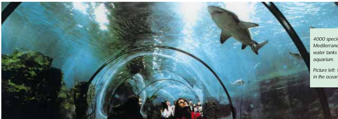
4000 species from the Mediterranean live in 21 sea water tanks in the Barcelona aquarium.